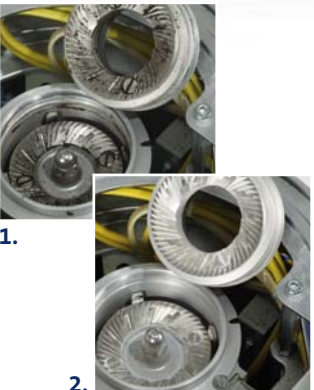
Espresso Grinder KE 640

Just as with other coffee equipment, cleaning your coffee grinder to remove stale coffee oils and residues helps to ensure the highest coffee quality.